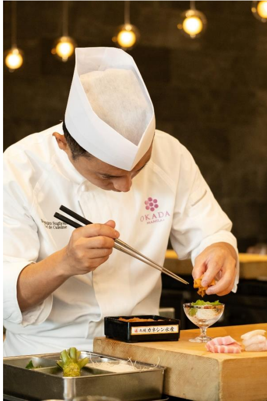
9. Experience Premium Dining at Okada Manila, offering a variety of culinary delights.