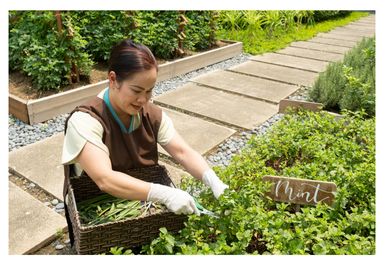
The Retreat Spa, a Forbes five-star-rated spa for the third consecutive year, cultivates select herbs and produce on-site, promoting fresh and healthy ingredients in spa treatments and refreshments.

As a recognized leader in sustainable tourism, Okada Manila's commitment to eco-friendly practices underscores its role in advancing environmental responsibility within the hospitality industry. The resort's participation in Earth Hour is just one of the many steps it is taking toward a more sustainable future for the planet.