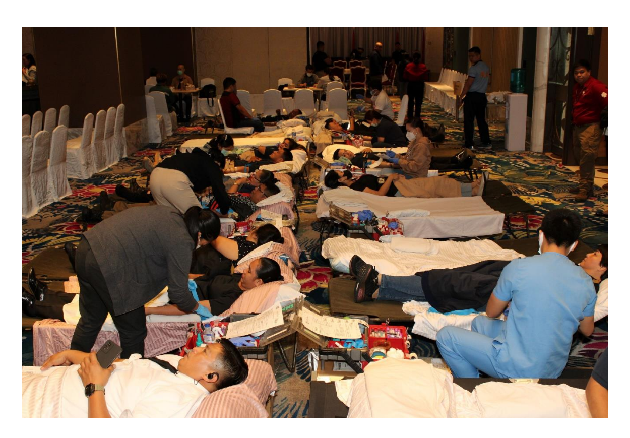
Okada Manila's combined efforts have resulted in the collection of 800 blood units, highlighting the impact of teamwork and a shared mission of saving lives.

Okada Manila further strengthened its commitment to this cause in 2024 by hosting two significant blood donation drives. The first, held in July, garnered 220 successful donors, while the second in October collected 162 blood units. Both events, conducted in partnership with the Philippine Blood Center (PBC), reflected meticulous planning to ensure donor safety and comfort, from medical screenings to post-donation care.