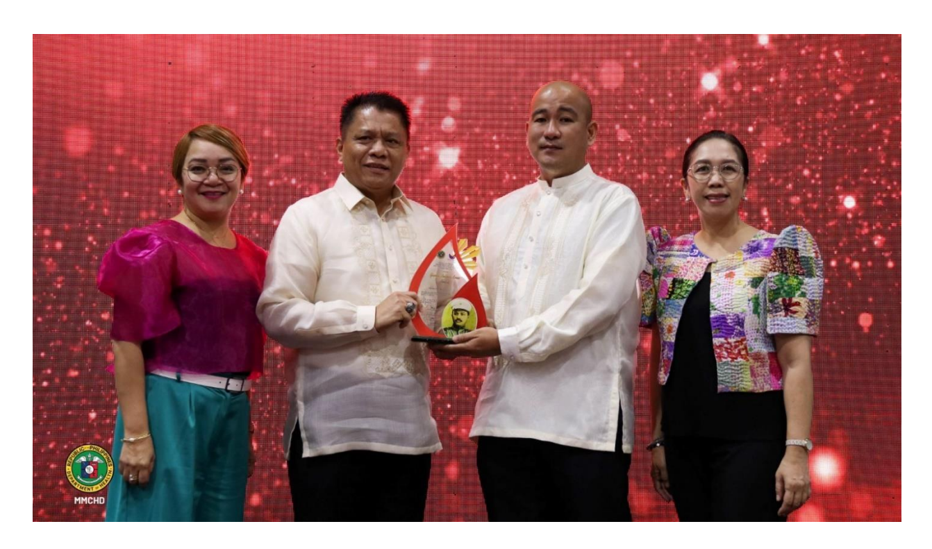
Okada\ Manila\ has\ been\ recognized\ by\ the\ Department\ of\ Health\ with\ the\ Gawad\ Antonio\ Luna\ Award\ at\ the\ Dugong\ Bayani\ Awards\ 2024.

MANILA, 29 November 2024 – Okada Manila, a Forbes 5-star destination in the Philippines, has been recognized by the Department of Health (DOH) with the Gawad Antonio Luna Award at the Dugong Bayani Awards 2024. This recognition celebrates Okada Manila's dedication to saving lives and fostering a culture of voluntary blood donation. Okada Manila continues to assist the government in its drive to provide adequate, safe, affordable, and equitable distribution of blood supply to those in need.