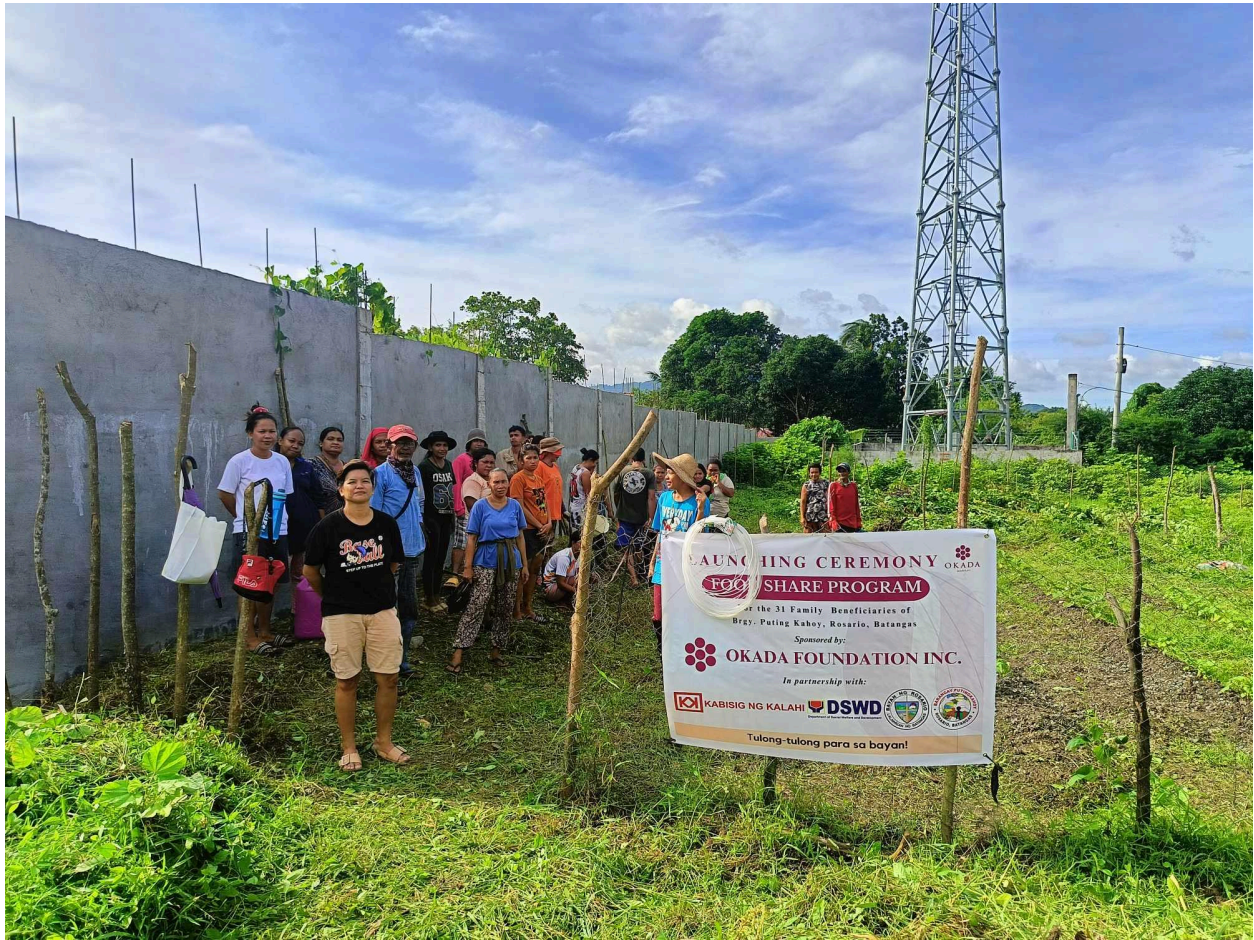
The OFI and KnK tarp proudly being set up next to the community garden in Barangay Rosario, Batangas.