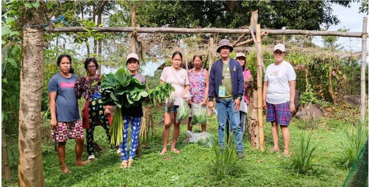
People harvesting their crops in Barangay Tanay, Rizal.

For more information on the initiatives of Okada Foundation, Inc., visit the Okada Manila site at: https://okadamanila.com/