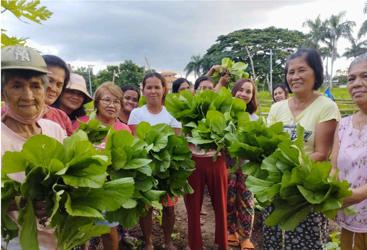
A group of women from Barangay Padre Garcia, Batangas holding a bountiful harvest of Pechay.

More than a year after the partnership between Okada Foundation Inc. (OFI) and Kabisig ng Kalahi (KnK) was launched, a bountiful harvest continues to bless the community gardens it established across different parts of the country.