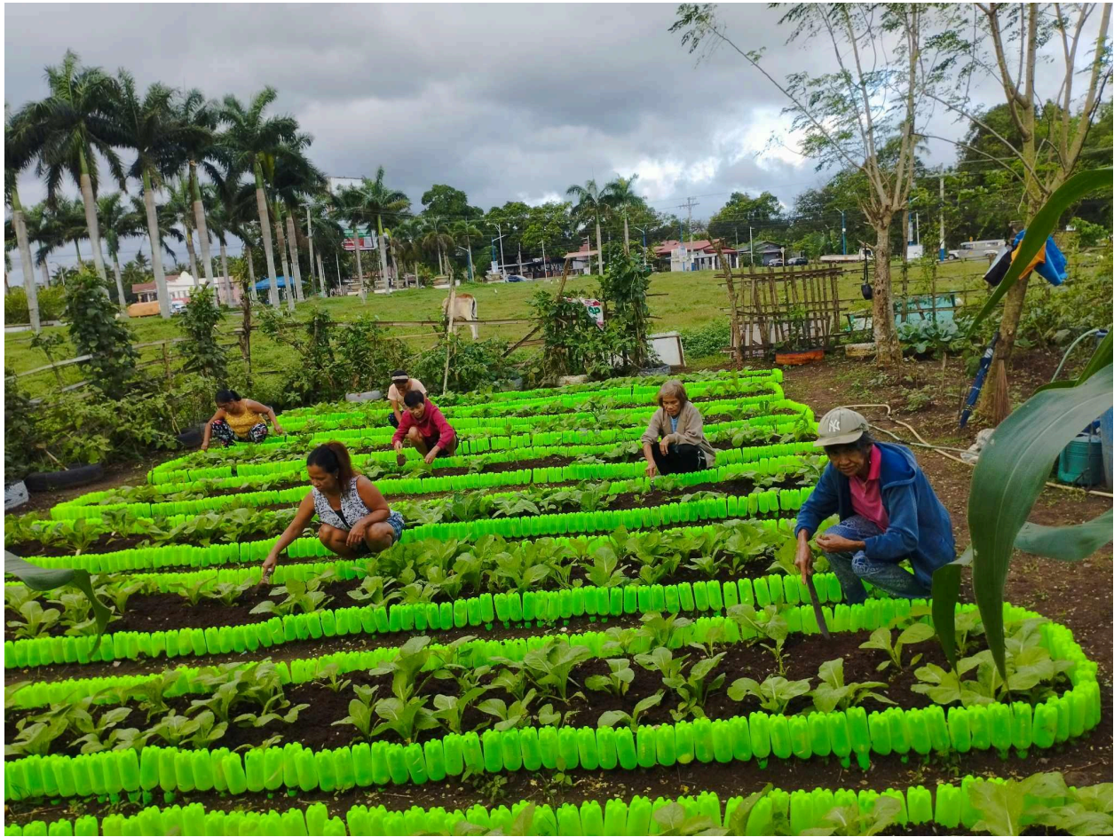
Communal garden being tended by women of Barangay Padre Garcia, Batangas